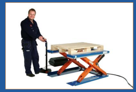
"U" shape versions also available. No ramp required!