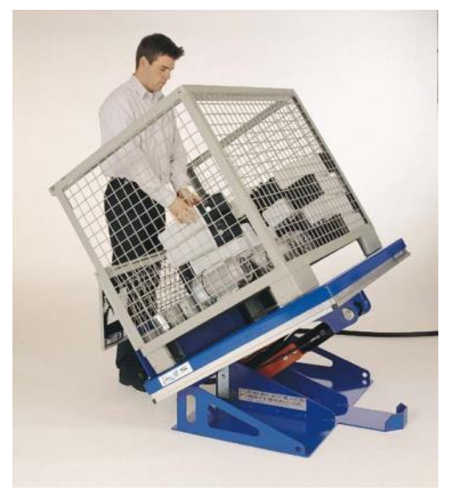
Ergonomic lift & tilt tables

For lifts intended for intensive use we incorporate our heavy-duty package. This includes grease points in all links, an air cooled hydraulic system, chromed axles and pins, steel runner gear, reinforced platforms and scissor arms. We can also provide continuously running motors, fast pumps and double acting hydraulic cylinders. The lift shown above features a gravity pallet roller conveyor. Powered rollers are also available.