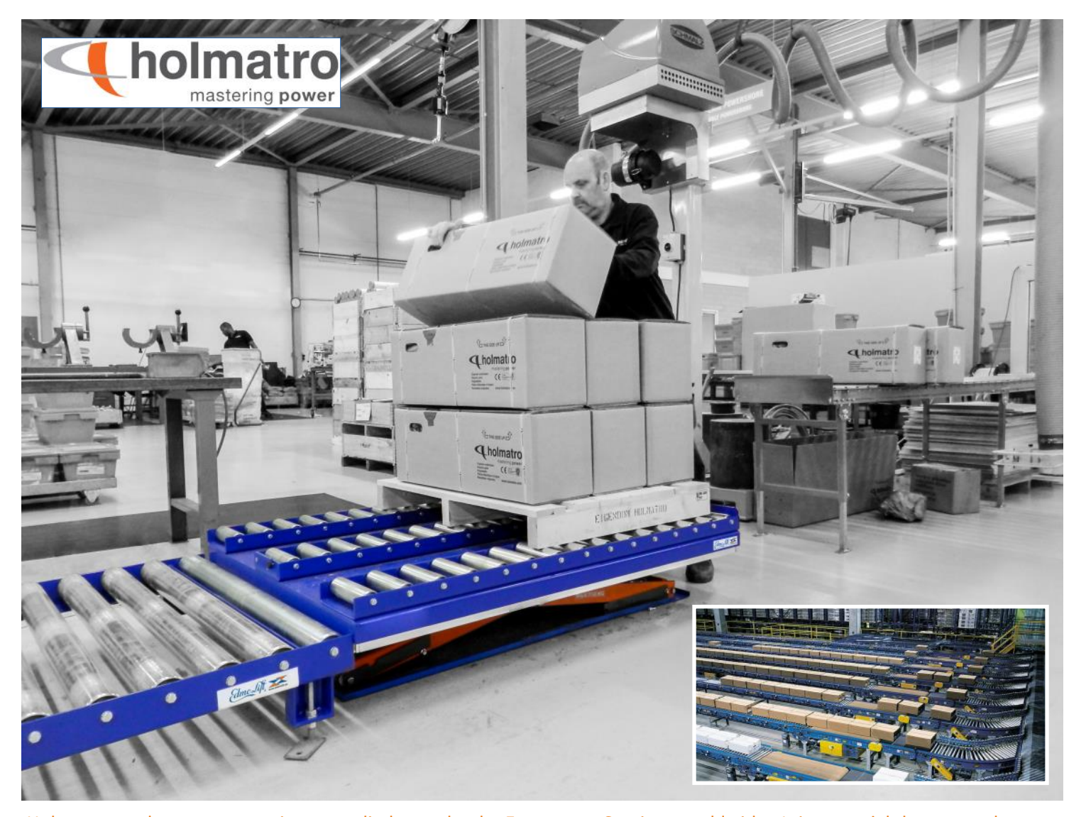
Holmatro produce rescue equipment relied upon by the Emergency Services worldwide. It is essential they use only the very best machinery within their production to ensure this vital equipment is delivered without delay.