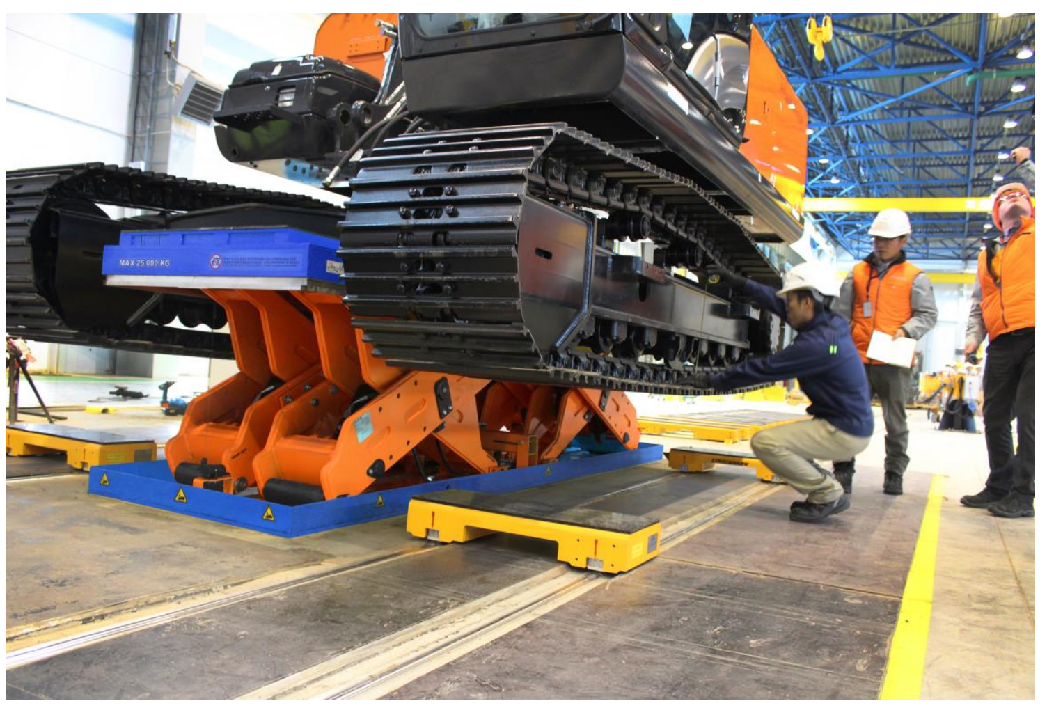
25,000Kg capacity scissor lift platform for Hitachi Construction Machinery Europe