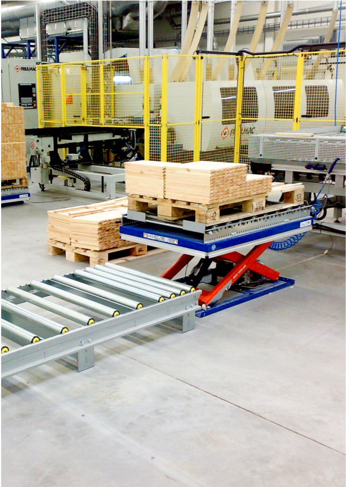
Ergonomic palletising in timber components factory