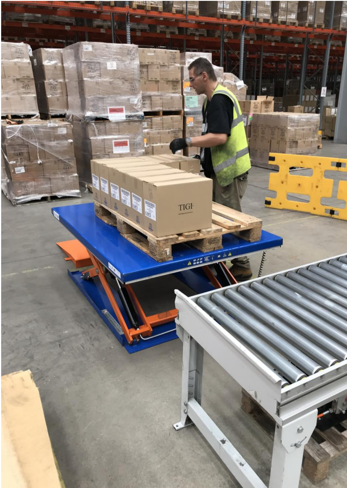
Ergonomic low profile pallet lift in warehouse