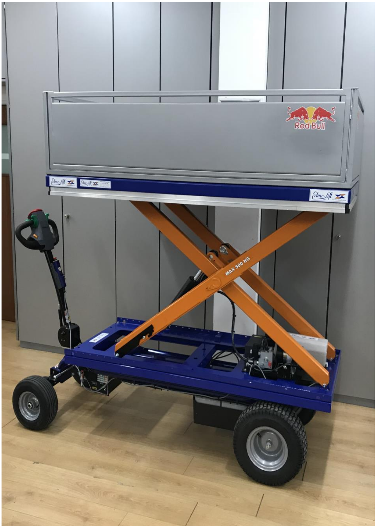
Ergonomic materials handling in motor racing factory