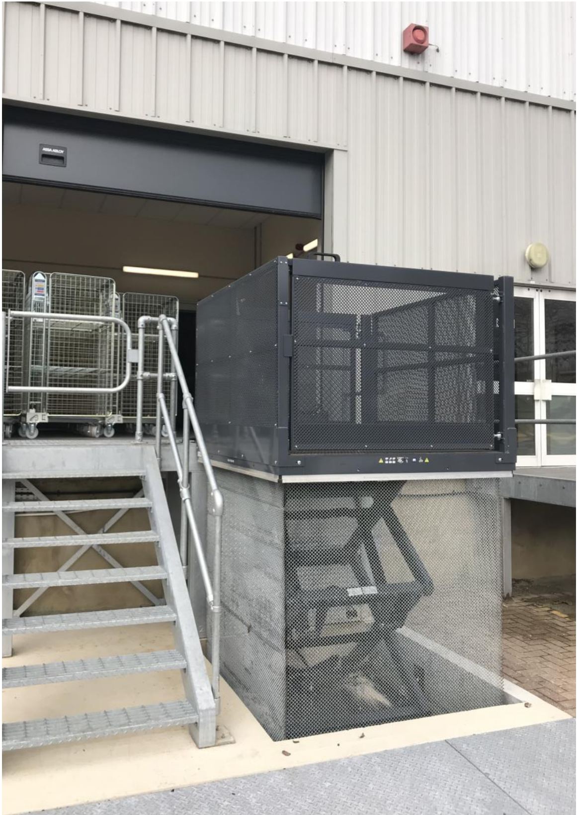
Split level goods lift located in loading bay of utility company