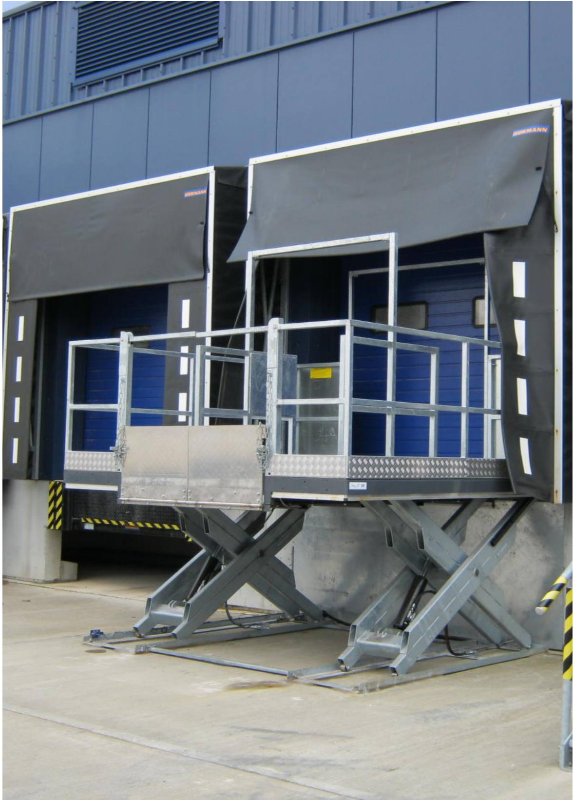
Low profile loading bay lift used for loading catering trolleys for airlines