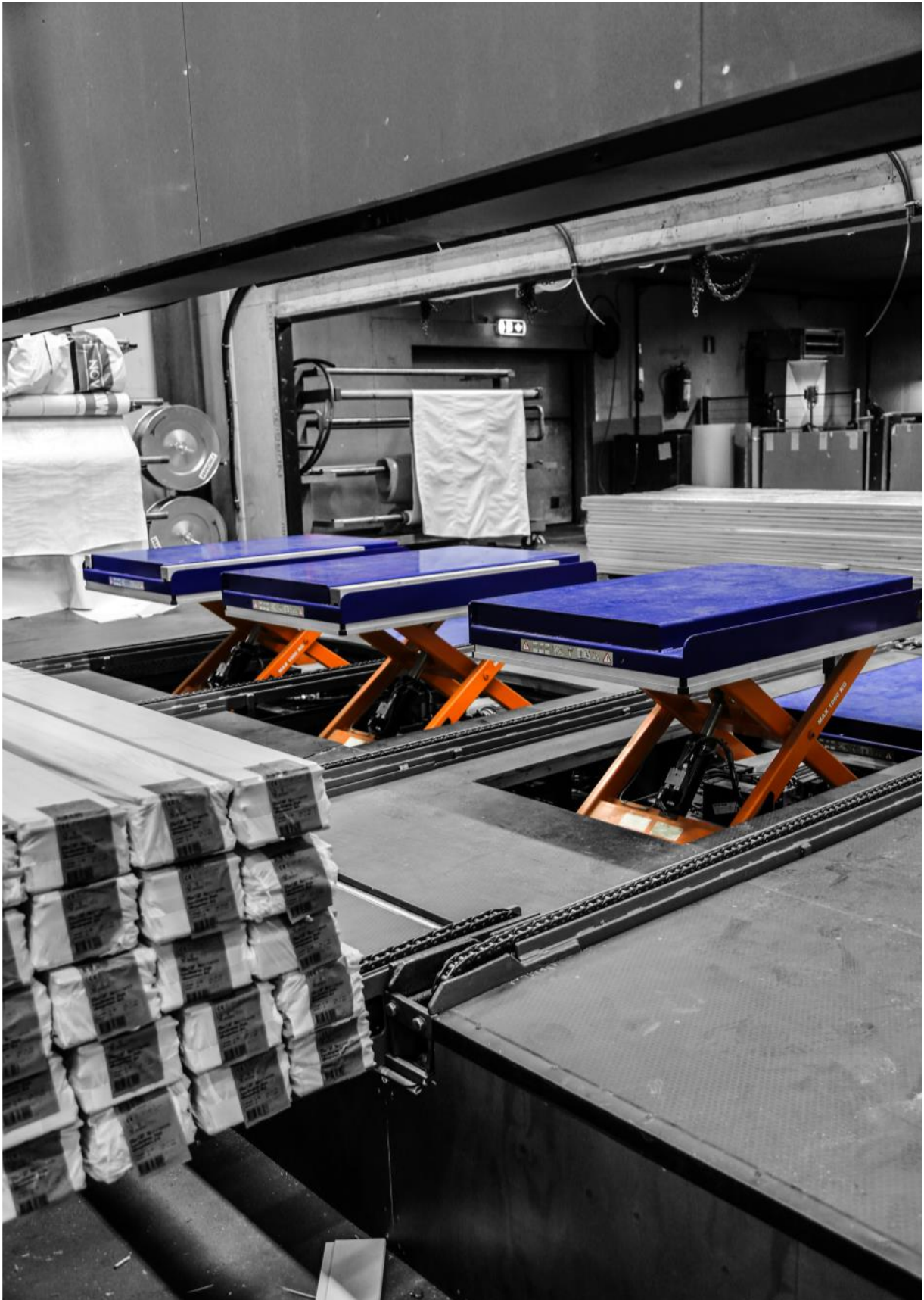
Automated positioning in aluminium extrusion factory