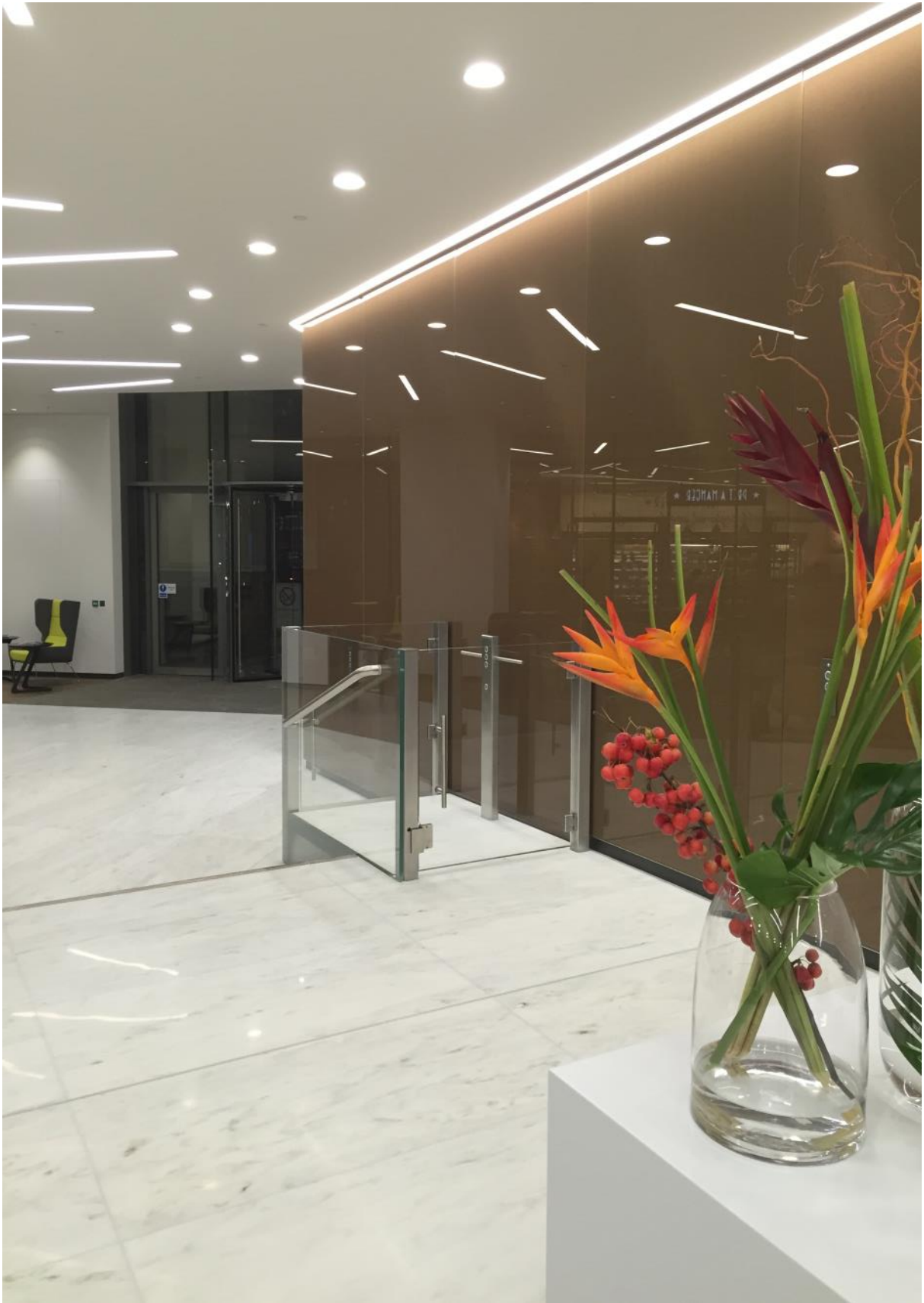
Premium disabled access lift is smart city office reception